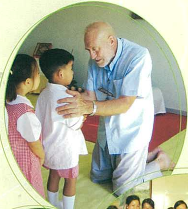
宗教活動 Religion Activities