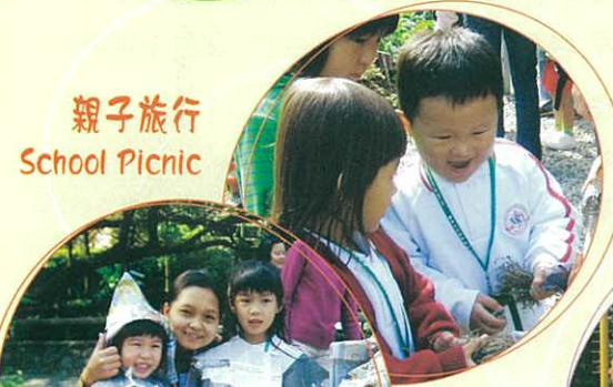
親子旅行 School Picnic