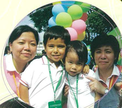
幼兒同樂日 Fun Day of Parent- children