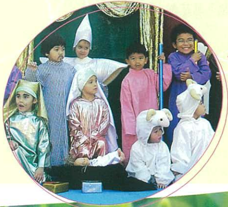
聖誕同歡 嘉年華 Joint School Christmas Carnival